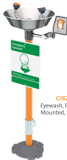
G1825 Eyewash, Pedestal Mounted, SS Bowl