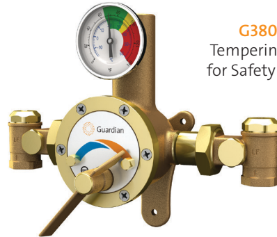
G3800LF Tempering Valve for Safety Station