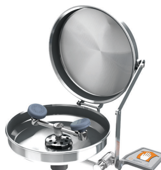
G1750BC Eye/Face Wash, Wall Mounted, SS Bowl with Cover