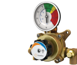
G3600LF Tempering Valve for Eyewash