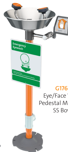
G1760 Eye/Face Wash, Pedestal Mounted, SS Bowl