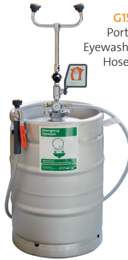
G1562 Portable Eyewash/ Drench Hose Unit