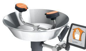
G1750 Eye/Face Wash, Wall Mounted, SS Bowl