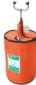
G1562HTR Portable Eyewash/ Drench Hose Unit with Heater and Insulation Jacket