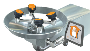
GBF1724 Eye/Face Wash, Barrier-Free