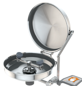
G1814BC Eyewash, Wall Mounted, SS Bowl with Cover