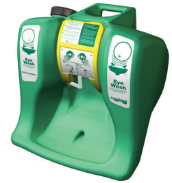
G1540 Portable Eyewash, Gravity-Fed