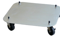
G1562DLY Dolly for Portable Eyewash/Drench Hose Unit