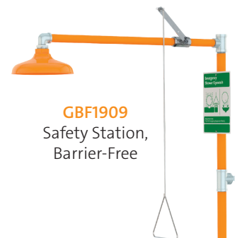
GBF1909 Safety Station, Barrier-Free