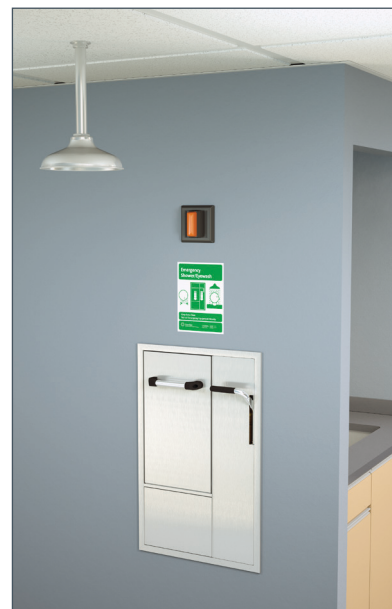
Recessed Safety Station with Drain Pan. Shown with Alarm. GBF2150, AP280-230