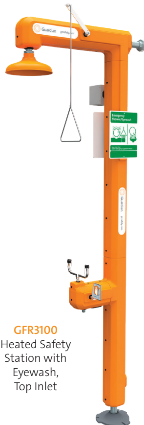
GFR3100 Heated Safety Station with Eyewash, Top Inlet