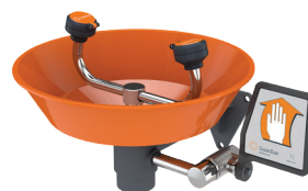
G1814P Eyewash, Wall Mounted, Plastic Bowl