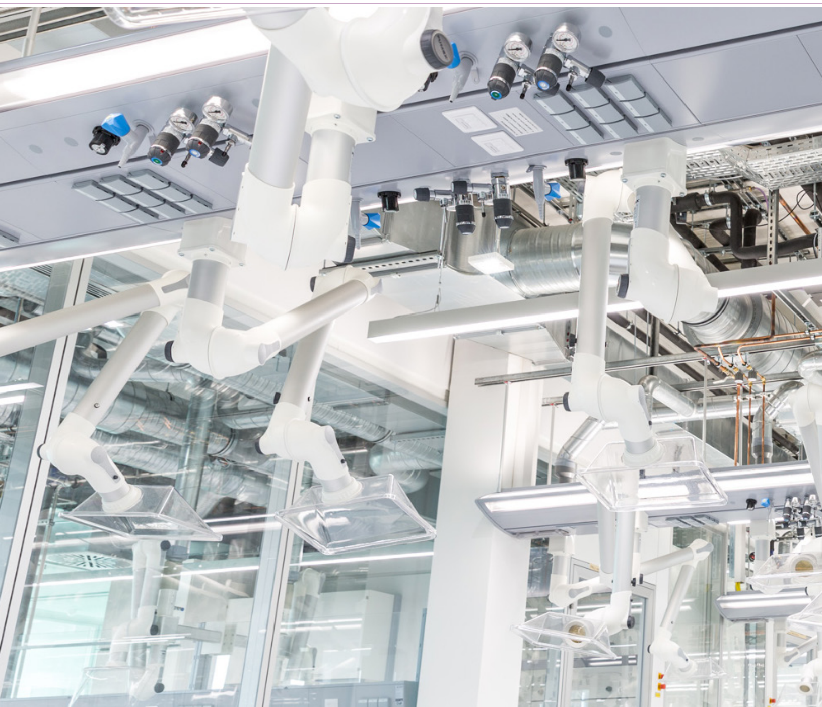
| LABORATORY TYPE ANALYTICAL & WET CHEMICAL