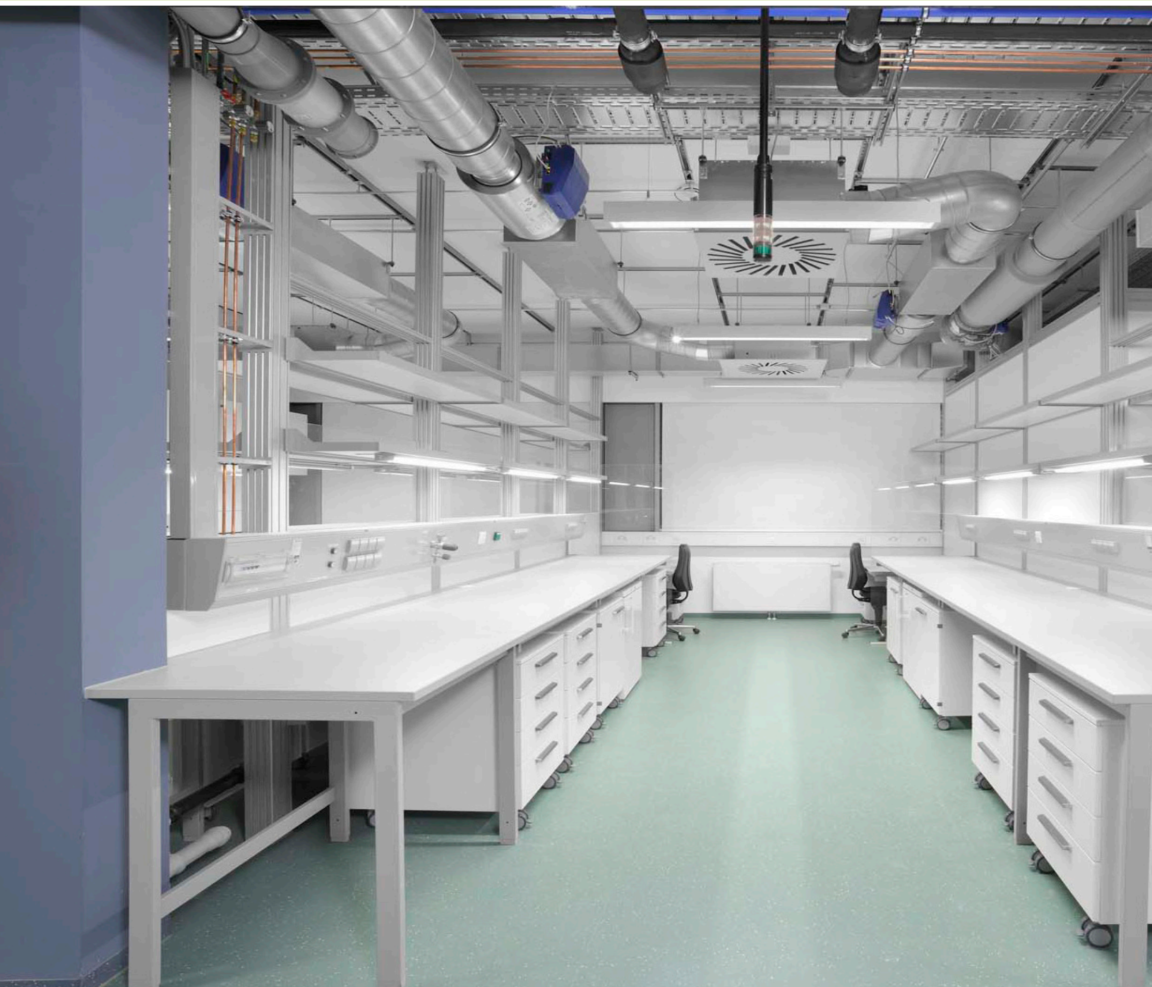
| LABORATORY TYPE BIOLOGICAL, RADIONUCLIDE & ANALYTICAL