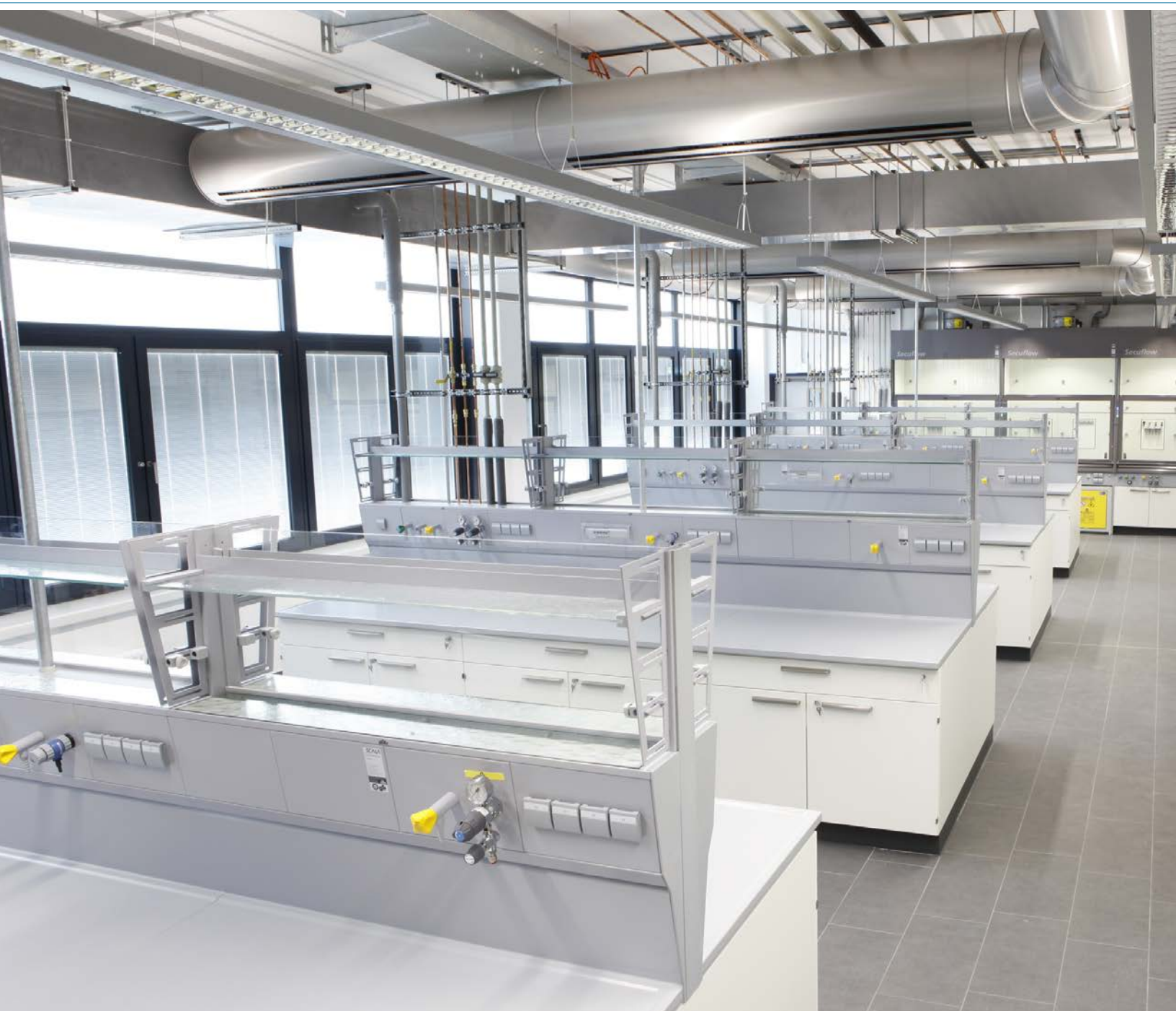
| LABORATORY TYPE CHEMICAL